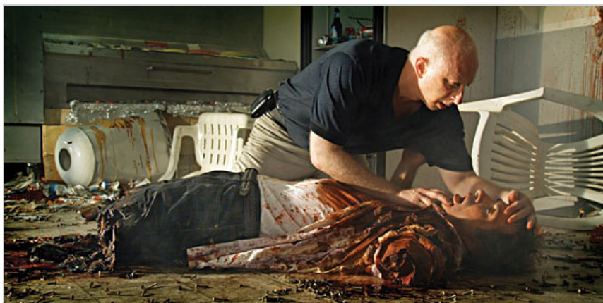
Take a Deep Breath

(Photo: Yon Thomas, Courtesy of the Artist and Postmasters, New York/GB Agency, Paris/Arratia, Beer, Berlin. Produced by Commonwealth)